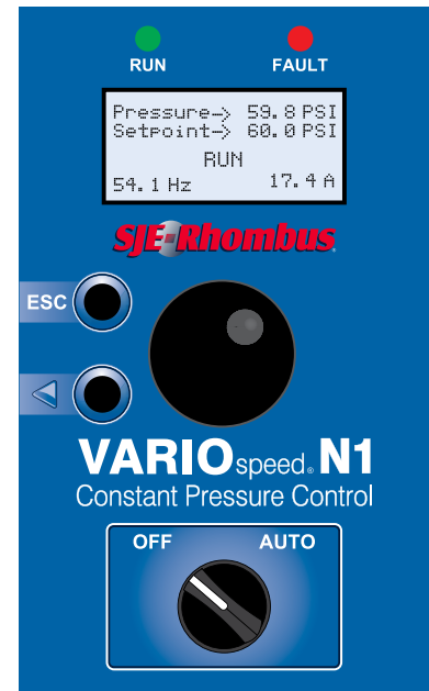
Display Interface (N1 shown)